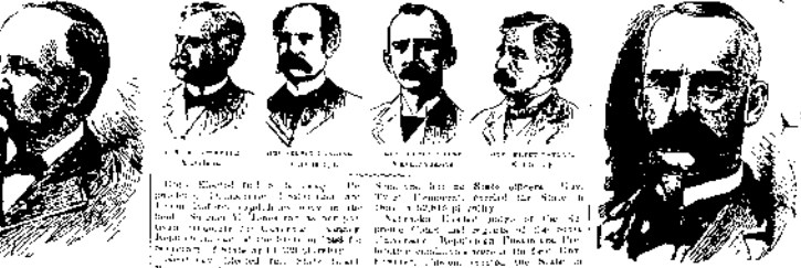
THE BATTLE IN BRIEF